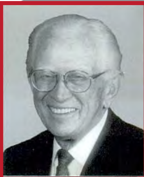
Senator Howard Metzenbaum

1988 - Senator Howard Metzenbaum (Ashkenazi Jew) sponsors senate bill S 1523 which permits gun owners to be charged with a federal racketeering offense.