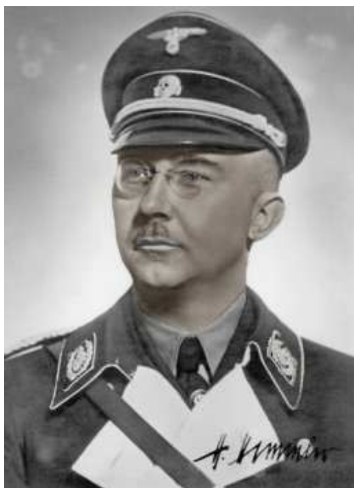
Heinrich Himmler 1900-1945

This e-Book is dedicated in loving memory to: