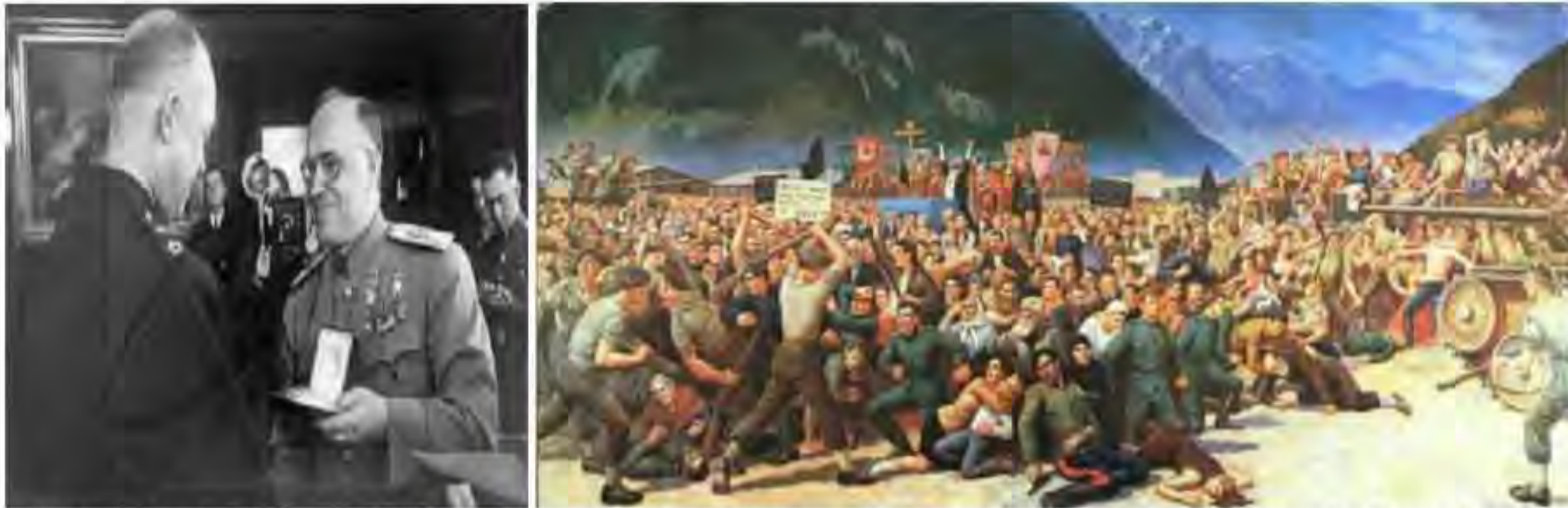
1- Red Army Chief Zhukov to Ike: "Good job Comrade". For delivering the nations of Eastern Europe, and millions of terrified Russian refugees to their death, Ike earned a Soviet Medal.

"Uncle Joe", and subjected to special tortures, including rape of the women. As a final insult from our "ally", Stalin holds on to 25,000 American POW's and 30,000 British, sending them to his Siberian Gulags, and even summarily executing some. (10) Ike, Churchill, and Truman are aware of the missing POW's but say nothing!