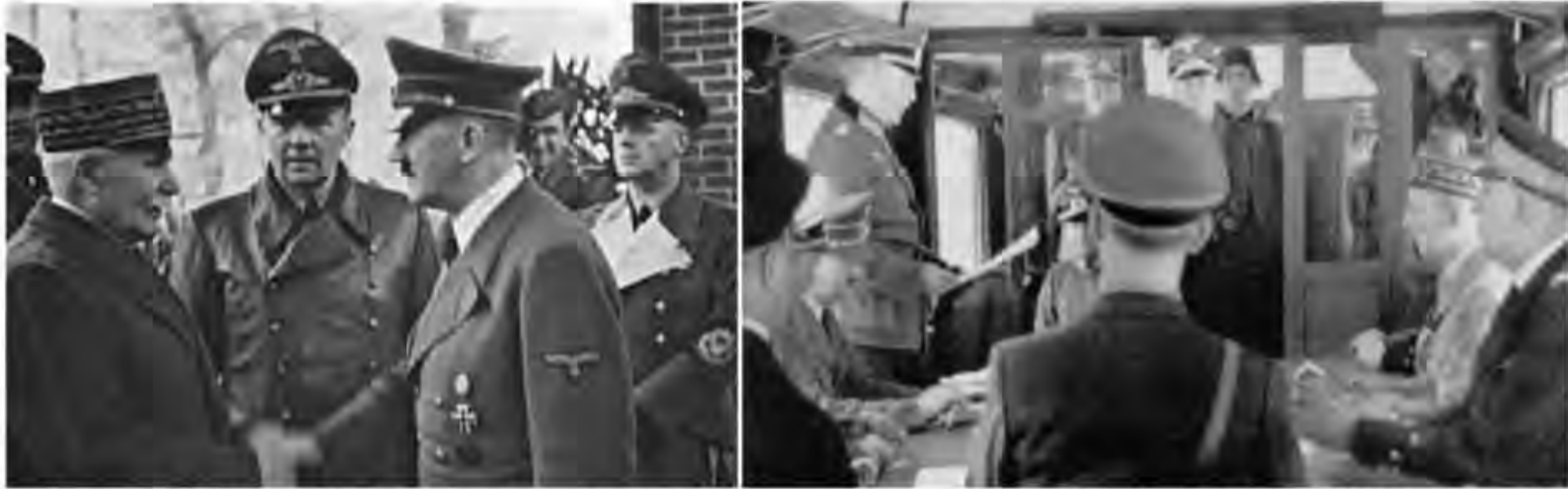
Hitler and Field Marshal Petain make peace. The armistice is signed in the same railway car in which Germany surrendered after World War I.