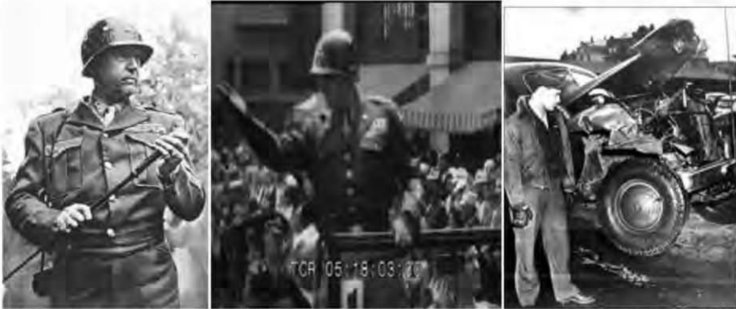
1 & 2 - Larger than Life " Patton received a hero's welcome in Los Angeles parade. His persona posed a threat to the NWO.